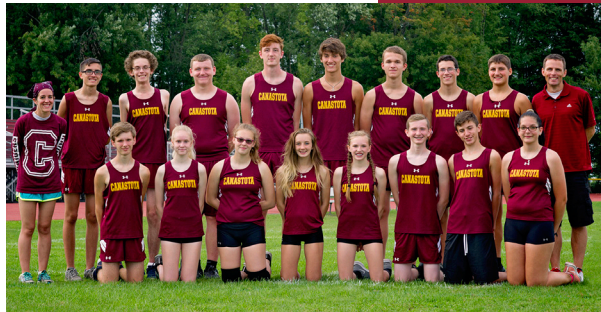
Varsity Cross Country