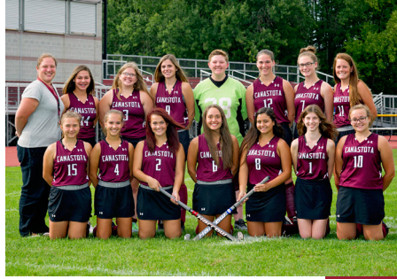
Varsity Field Hockey