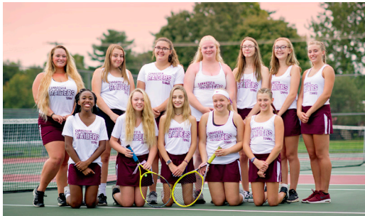
Girls Varsity Tennis