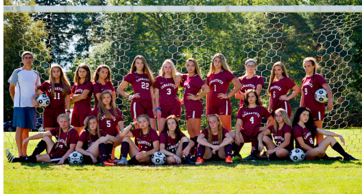
Girls Varsity Soccer