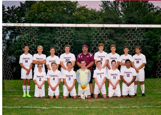
Boys Varsity Soccer